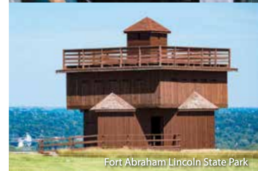
Fort Abraham Lincoln State Park