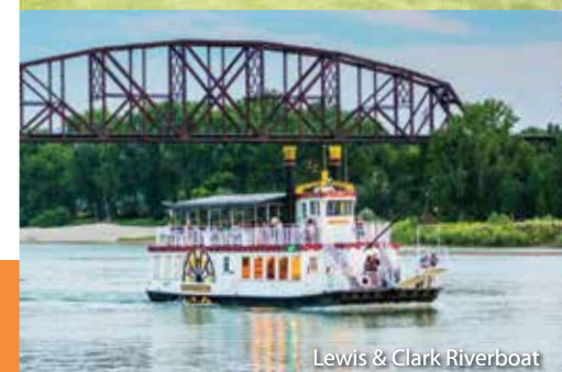
Lewis &amp; Clark Riverboat