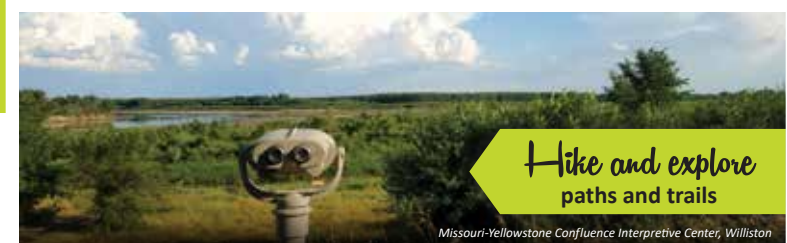
Missouri-Yellowstone Confluence Interpretive Center, Williston