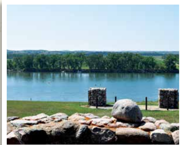
Photo location: Double Ditch Indian Village State Historic Site, Bismarck

Did you know that you can ride an elevator seven stories up for spectacular 10-mile views of the Red River Valley at the Pembina State Museum? Or ride an elevator 50 feet below ground to tour the state's only intact missile launch control center open to the public? Visit the Ronald Reagan Missileman Missile Site near Cooperstown. Or learn about Medora, the extraordinary woman behind the town's name, at her summer home—the Chateau de Morès State Historic Site.