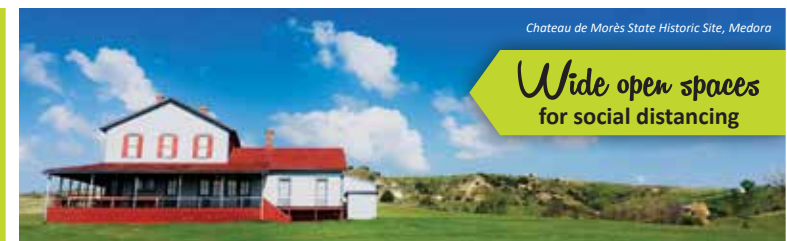
Chateau de Morès State Historic Site, Medora