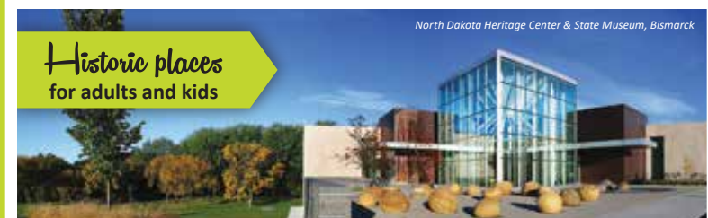
North Dakota Heritage Center & State Museum, Bismarck